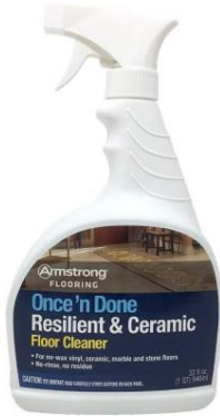
Once N' Done