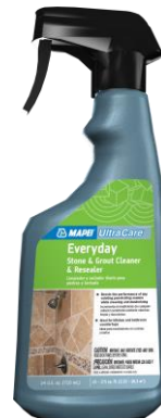
Stone & Grout Cleaner and resealer