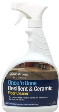
Once N' Done