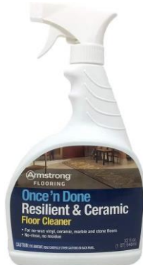
Once N' Done